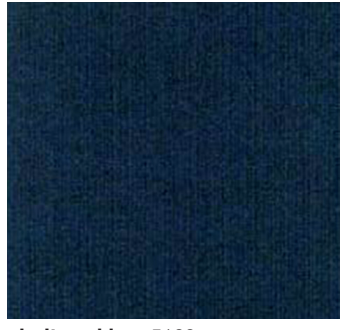
sheltered bay 5139

product construction yarn/fibre pile weight total thickness width roll length co-ordinates with