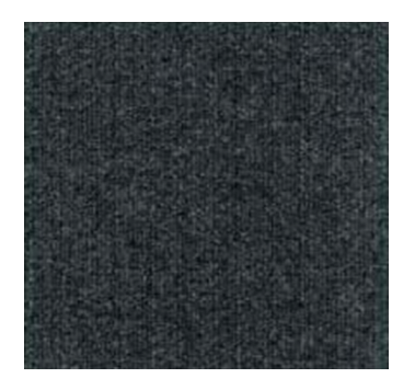
strong winds 5078