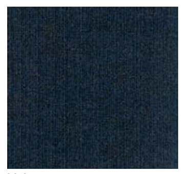
high seas 5109